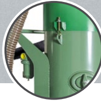
CONTRACOR Z-200 BLAST POT

mounted directly on the Contracor Z-200 series blast pot.